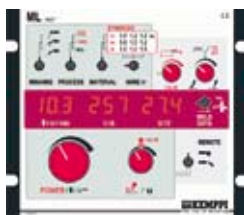
ML control panel