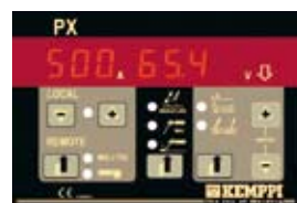
PX control panel