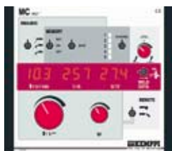
MC control panel