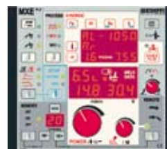
MXE control panel