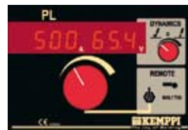
PL control panel

The Kemppi Pro Evolution control panels for MMA welding include many useful features, such as automatic hot start, automatic arc dynamics, and anti-freeze features.